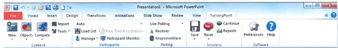
PC PowerPoint Ribbon

Open PowerPoint through TurningPoint. Select the Polling tab and click PowerPoint Polling.